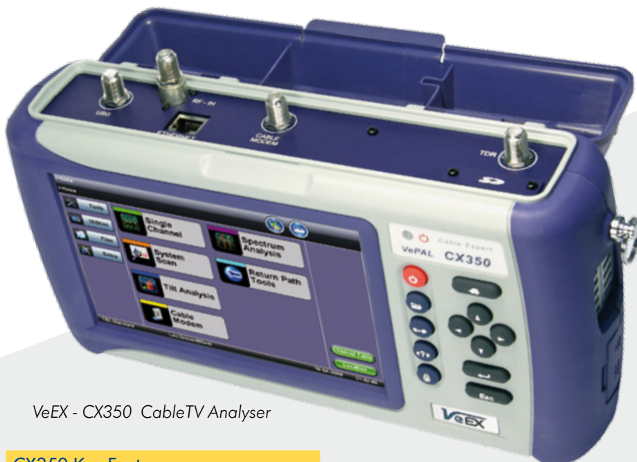
VeEX - CX350 CableTV Analyser

CATV Network Testing Simplified - The VeEX™ VePAL CX350 is a portable, fully integrated test solution for legacy analog and digital Cable TV networks supporting next generation DOCSIS/Euro DOCSIS 3.0 cable modem.