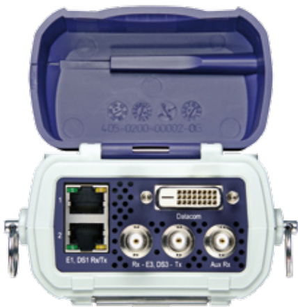
TX130+ Test Connectors

The TX130+ is designed for field engineers that need an easy-to-use, hand-held and battery-powered field unit. To simplify and ensure rapid testing, the unit auto-configures itself to the signal detected, minimizing operator involvement