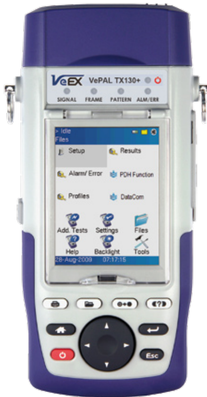
TX130+ Test Set