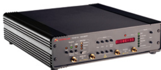
TG1B1-A - 12.5G BERT

40G BERTs and PRBS generators up to 56Gbit/s are available as well.