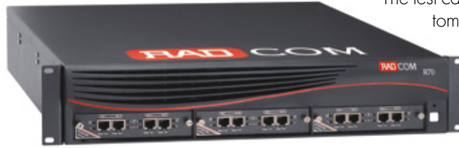
Radcom R70S High Performance Probe

The Omni-Q solution can detect and classify the different flow types within the operator's IMS service offering. This is achieved by creating a 'master' eDR concept, derived from the correlated sessions and using the correlated session for KPIs, rather than just for a signaling ladder diagram.