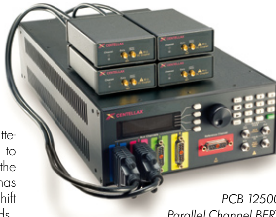
PCB 12500 Parallel Channel BERT

Labview drivers are available at no cost.