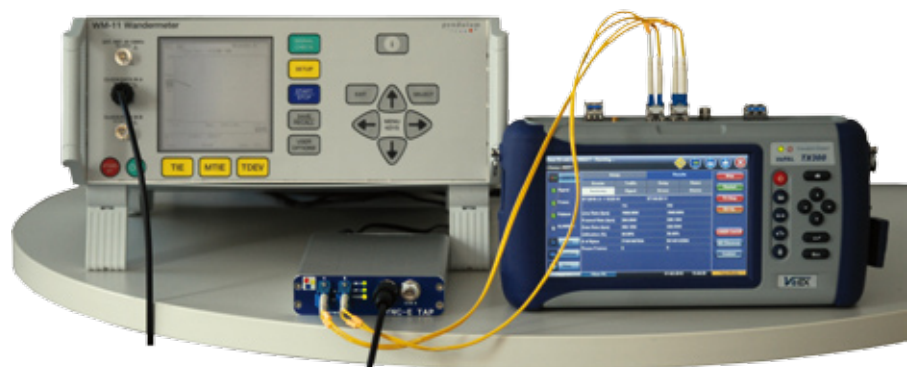
CuBro - SyncE Tap - Test Setup

provides 2 clock outputs for connection to a Pendulum Wandermeter